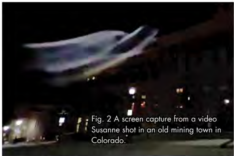
Fig. 2 A screen capture from a video Susanne shot in an old mining town in Colorado.

In this pursuit, Susanne's husband, Arthur, stands as her steadfast companion, providing protection during both day and night excursions. Armed with little more than a smartphone or a standard digital camera, Susanne employs a methodical approach to her craft. It's a process that demands meticulous scrutiny, an unflinching